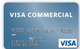
Visa Commercial Cards