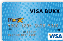
Visa Buxx/Teen Card