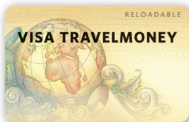
Visa TravelMoney Cards