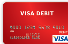
Visa General Purpose Reloadable Cards