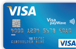
Contactless & EMV Chip Cards