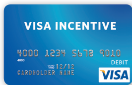
Visa Incentive/Rebate Cards