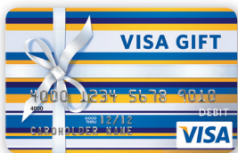
Visa Gift Cards

Visa Prepaid Processing Service supports the following prepaid options to meet your strategic goals and customer needs.