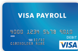
Visa Payroll Cards