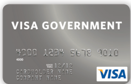
Visa State and Government Cards